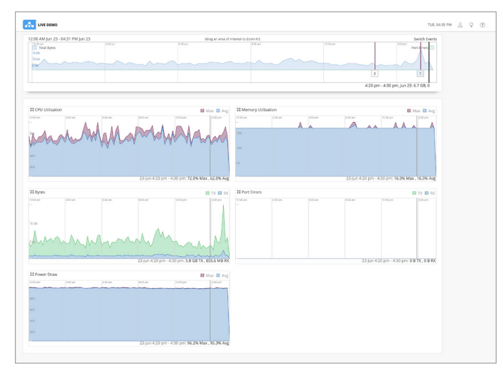
Figure 4: Switch health metrics

Al-Driven Switch Insights. Know exactly how Juniper EX and QFX Switches are performing with detailed device-level switch metrics and insights such as CPU, memory utilization, and virtual chassis status, You can also see metrics down to the port level, including bytes transferred, traffic utilization, and power draw. You'll receive performance series data and real-time status data for connected endpoints. Wired Assurance also logs and correlates switch events, like configuration changes, firmware updates, and system alerts. When admins hover over switch ports on the management interface, status details pop up about wired clients, access points, and connectivity, such as connected speed, PoE status, and throughput.