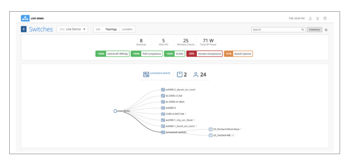
Figure 6: Wired Assurance topology view

Wired Client Health Metrics. See an inventory of switches and wired devices in a list, topology, or location view. Wired Assurance ensures optimal network operations with key health metrics, such as switch firmware compliance, switch AP affinity, PoE compliance, and missing VLANs. These metrics are available for multivendor environments across third-party wired switches with a Juniper access point and Marvis license. The addition of BPDU Guard and MAC limit hit error identification enhances the ease of administrating port security at scale.