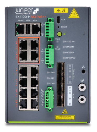
Figure 5: EX4100-H-12MP