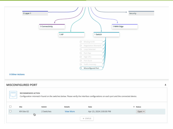
Figure 2: Marvis Actions for wired switches

For more information, see Juniper Mist Wired Assurance.