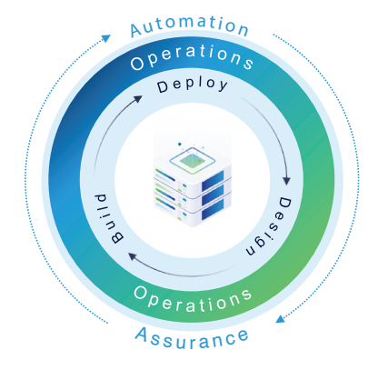
Figure 3: The Apstra solution continuously automates and validates the network.

Operators are under constant pressure to do more with less. Stagnant or even shrinking budgets and resources, compounded by network complexity, result in delayed responses when changes occur.