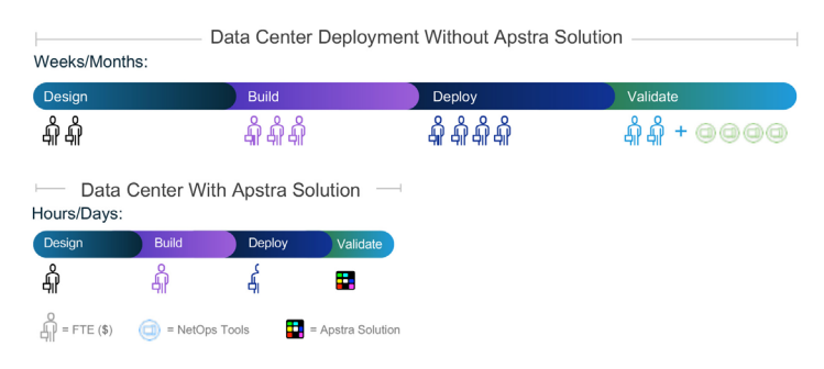
Figure 2: Automation improves efficiency.

Data center deployments are increasingly complex, especially for manual node-by-node configurations and provisioning, potentially leading to errors, inconsistencies, and delays. Apstra dramatically simplifies network implementation by supporting both single- and multivendor switch environments as well as a range of network operating systems. The system's open architecture allows organizations to design a network that meets their business requirements first, then select the hardware that best aligns with that design.