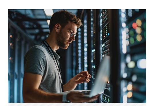
The JVD program develops well-characterized, multidimensional solutions that reduce complexity for networking teams